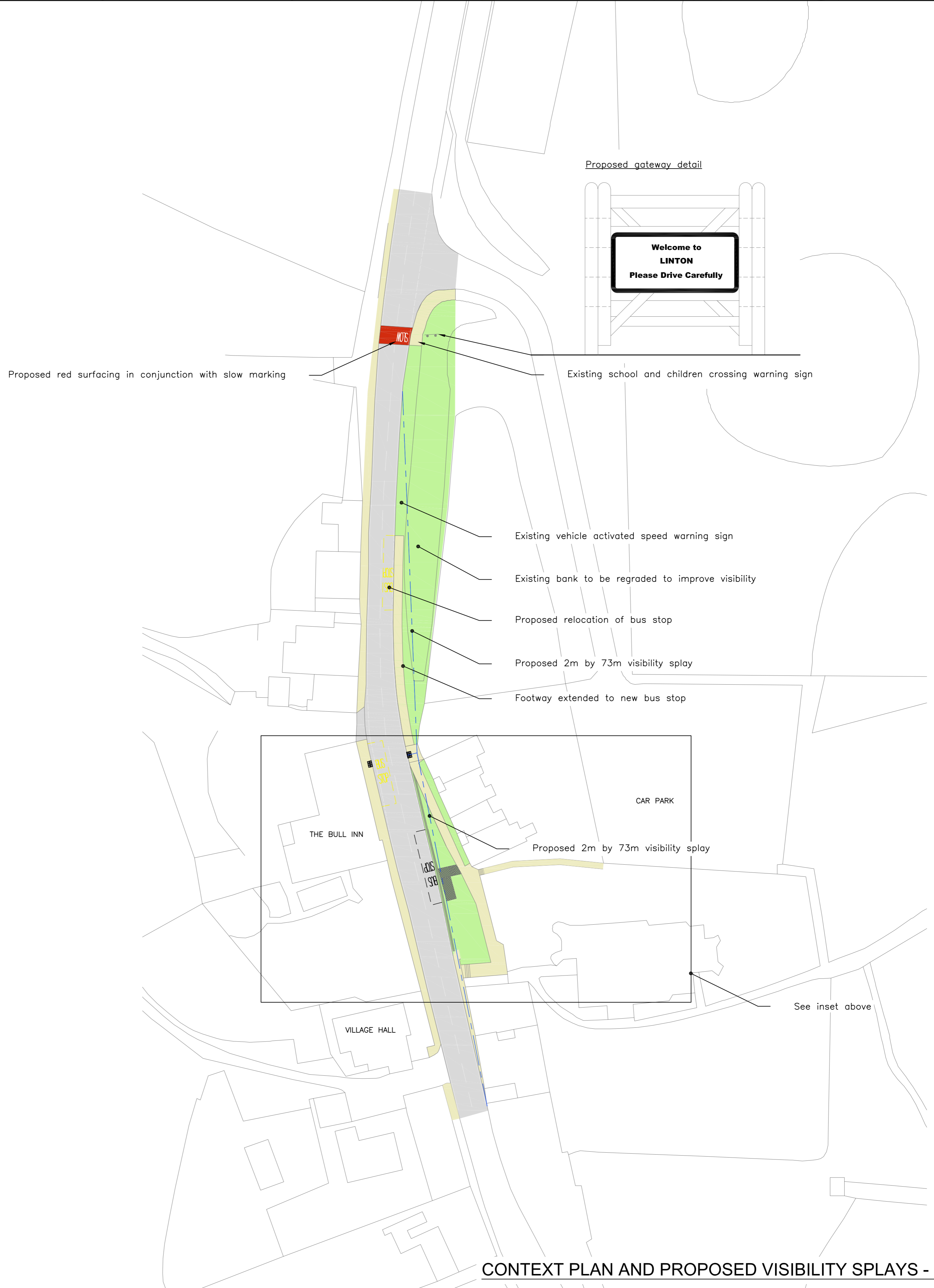
CONTEXT PLAN AND PROPOSED VISIBILITY SPLAYS - SCALE 1:500